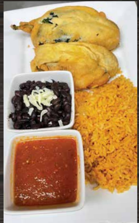
TWO CHILES POBLANOS

Grilled peppers, onions, mushrooms, broccoli, spinach and zucchini. Served on a bed of rice. Topped with cheese sauce - 9.99