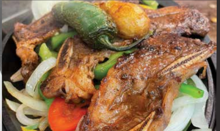
COSTILLAS DE RES