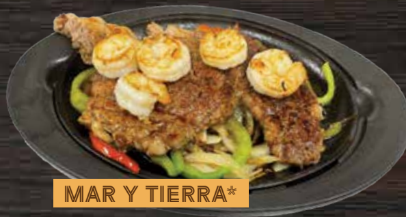
MAR Y TIERRA*

Grilled salmon. Served with a combination of mixed veggies and rice - 14.50