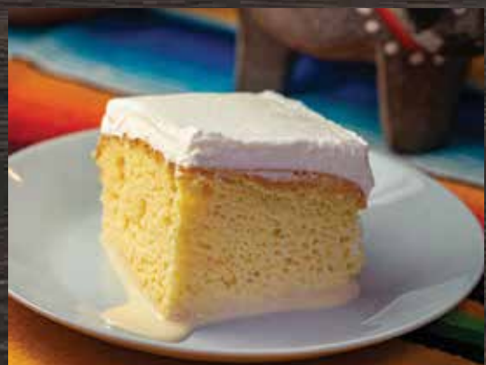
TRES LECHES CAKE